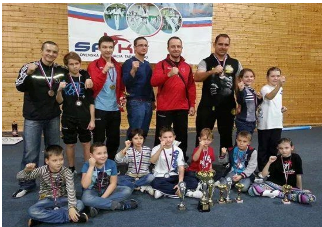
Slowakische Meisterschaft im Taekwondo, Dezember 2014.